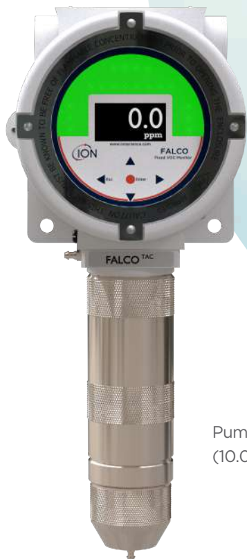
Pumped TAC (10.0eV) model