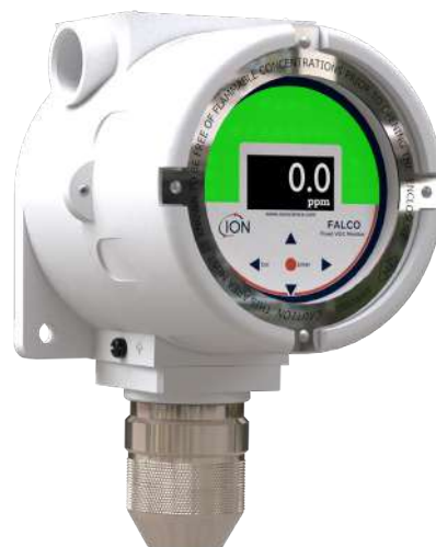
Diffused 10.6eV model

FALCO is the latest generation of fixed photoionisation detectors (PIDs) from ION Science that continuously detect a wide range of volatile organic compounds (VOCs).