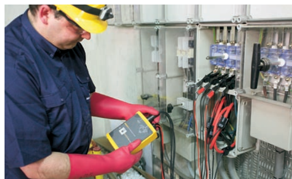
Power Quality Recording Tool