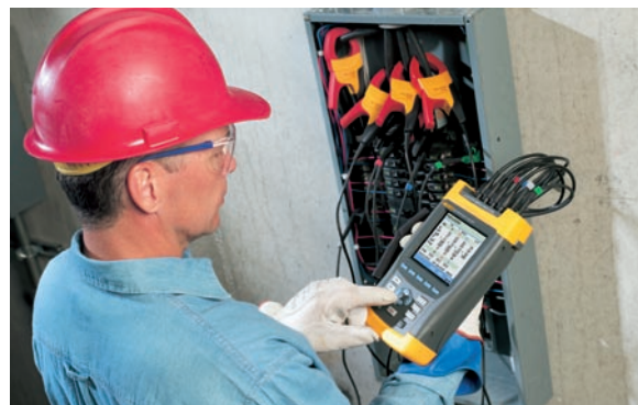
Power Quality Troubleshooting Tool

Such recording and analysis tools are also useful for conducting load studies to determine whether the existing electrical system can accommodate the addition of new loads. The measured results are analyzed later back in the office, and reports are created on a PC.