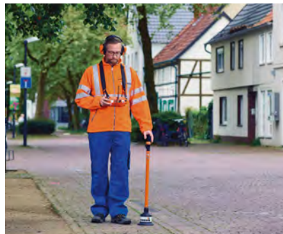
Pinpointing with the SeCorrPhon AC 200