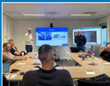
Cursussen en workshops