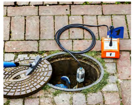
Performing correlation with the RT 200 radio transmitter and the UM 200 universal microphone