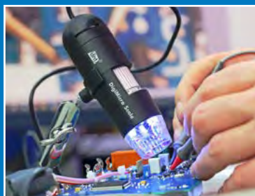
Onderhoud, reparatie en kalibratie