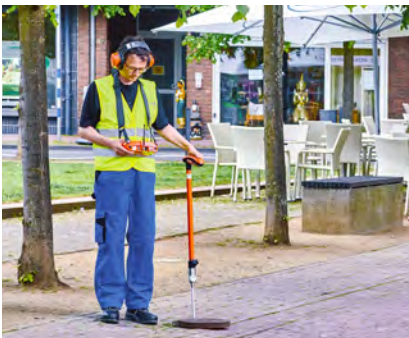
Pre-locating with the SeCorrPhon AC 200