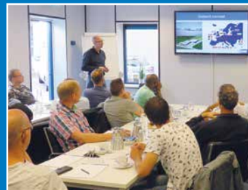
Cursussen en workshops