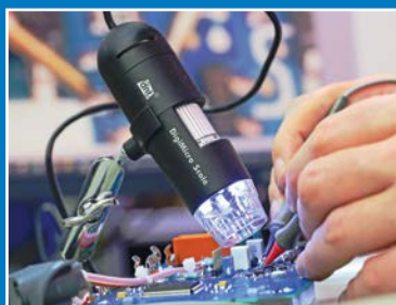
Onderhoud, reparatie en kalibratie