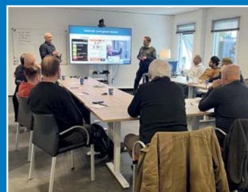
Cursussen en workshops