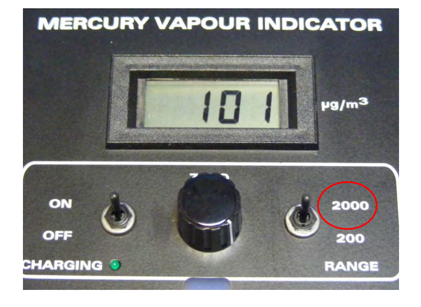
Range: 0-2000 µg/m<sup>3</sup>

This shows the mercury concentration in the monitored environment.