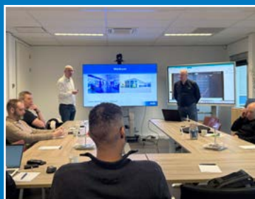
Cursussen en workshops