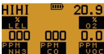
Display in alarm conditions