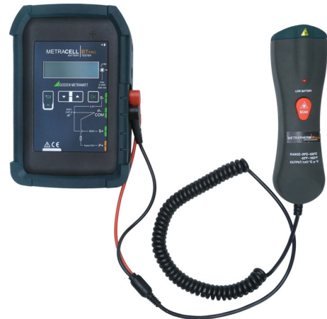
Figure 3: Battery tester with temperature sensor METRATHERM IR BASE (Z680A)