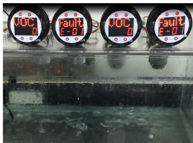
Figure 2. Falco used in condensing environments.

Figure 2 shows that the Falco can even be used in condensing environments. The first and third Falco's have Ion Science's new Typhoon Technology that prevents condensation on the sensor and avoids operating faults and corrosion. The second and fourth units were operated in the conventional way without Typhoon design, showing the fault condition. This capability to operate in condensing conditions expands the Falco's applications to wet environments including outdoor use without the need for weather enclosures, monitoring the headspace of refinery wastewater streams for excessive hydrocarbon contamination, and monitoring the effluents of activated carbon systems used to treat contaminated water.