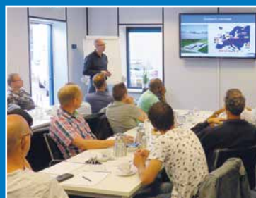
Cursussen en workshops