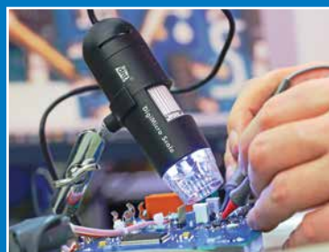
Onderhoud, reparatie en kalibratie