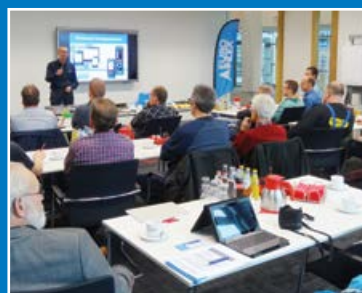
Seminars en workshops